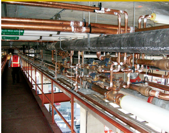
On the mezzanine deck, all tower piping is transferred to a vertical stack on this floor.

Ceiling diffusers and linear slot diffusers were carefully chosen in each zone to provide the correct throw and noise criteria.