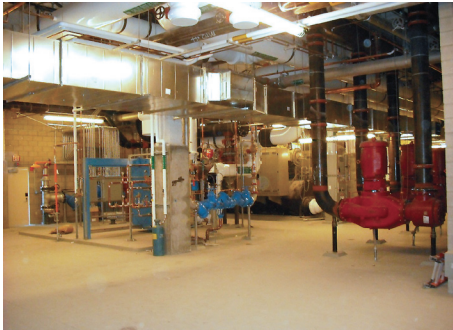
The central plant includes three 1,300 ton Trane centrifugal chillers, variable speed chillers, and variable primary piping.

with thermostats to provide individual comfort control for each room.