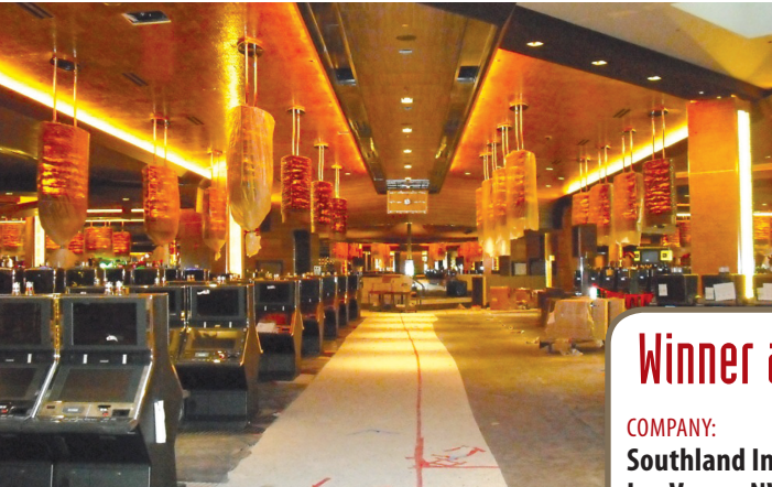
Ready to roll the dice. The 90,000 sq. ft. gaming area interior features 1,900 slot machines and 64 gaming tables.